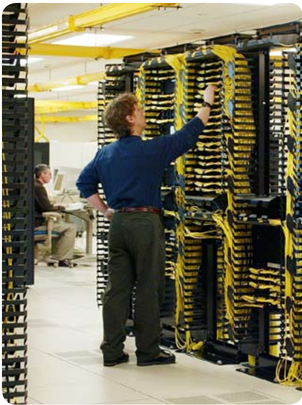
Proper Cable Management

Your network equipment can only perform as well as your cables. A gigabit port is of no value if the cable connecting that port is damaged. All cabling and connectivity within the data center need to be deployed with proper bend radius protection, well-defined cable routing paths, room to work on connectors and cables without affecting adjacent circuits or ports, and physical protection for equipment cables, intrafacility cable, patch cords, and jumpers. Without end-to-end cable management, some of the problems encountered include cables stepped on and piled-up in raceways, maximum bend radius exceeded, difficult connector access, and hours to trace cables, all of which increases the time required to decommission hardware and bring new hardware online.