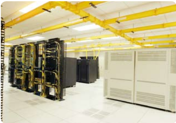
Ample Data Center White Space

The cost to build a data center can be upwards of $1,000 per square foot. Clearly, maximizing physical space is a critical aspect of data center design. Designers need to assess future growth potential and ensure there is a sufficient amount of space for the future. Data centers require ample areas of flexible “white” floor space that can be easily reallocated to a particular function, such as a new equipment area. Finally, room is needed to expand the data center if it outgrows its current confines. This can be accomplished by ensuring that the space surrounding the data center can be easily and inexpensively annexed.