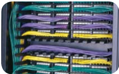
Angled Patch Panels and Cable Managers