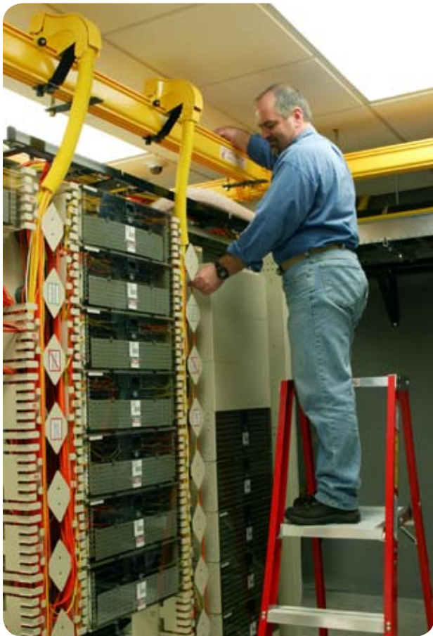
Vertical and Horizontal Cable Routing

Ample vertical and horizontal cableways are essential in maximizing the density of your data center and supporting future growth and manageability. It's important estimate the amount of pathway space based on fill capacity and the number of additional cables that may need to be deployed in the future. Horizontal cable tray installed both above the racks and in a raised-floor system creates a protected pathway as cable traverses between functional areas and equipment racks in the data center. Good routing systems will provide adequate support, keep fiber separate from copper cable, protect from out-of-tolerance bends, and promote neat, easily accessible runs. Without proper routing systems, cables may hang unprotected. Exposed cables can accidentally snag, which can result in damage to the connector or cable itself. Over time, the weight of hanging fiber can also cause bends outside the acceptable limit, further damaging fiber and impacting reliability.