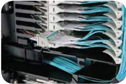
Easily Accessible Adapters and Connectors