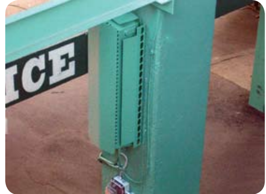
FlexWave microBTS (Figure 1)

The microBTS can withstand harsh weather and environmental conditions, including hot climates, wet regions, salt fog areas, and deployments with a heavy concentration of dust, dirt, brake dust, or other pollutants and contaminants. An optional solar shield is available for direct solar load applications.